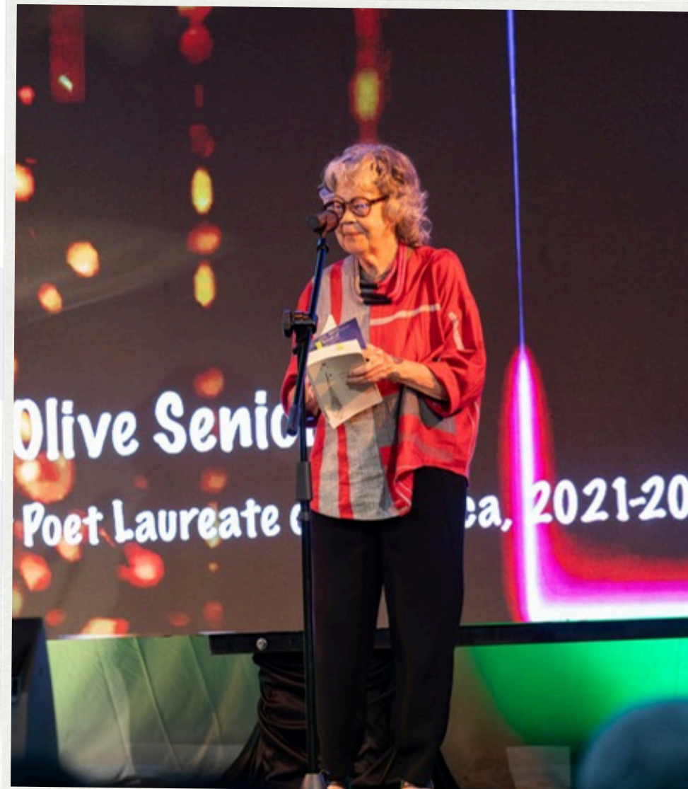
Dr. Olive Senior, Jamaican Author and Former Poet Laureate of Jamaica 2021-2024