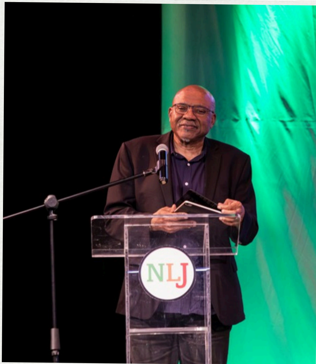
Professor Kwame Dawes, CD Poet Laureate of Jamaica 2025-2028

“One of the exciting things about this contest is that you get a chance to read what people are thinking about and what people are writing about in Jamaica. So I've learned a number of things from this exercise and these are truths that are valuable. The first is that Jamaicans are still writing poetry and I don't take that for granted and I don't take that lightly. The second thing is, there are still people who believe that language and the use of language to articulate feeling, thought and experience remain valid and necessary and that was demonstrated in the work that we saw.