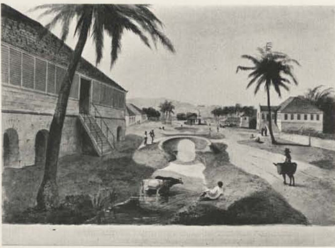
Holland Estate, St. Thomas in the East