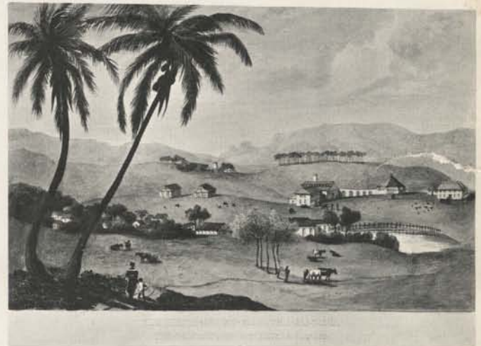
Houghton Court, Hanover