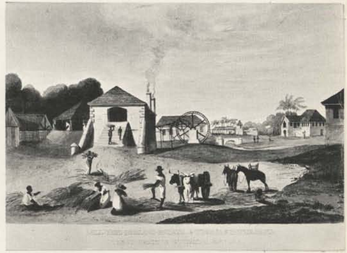
Millyard Holland Estate, St. Thomas in the East