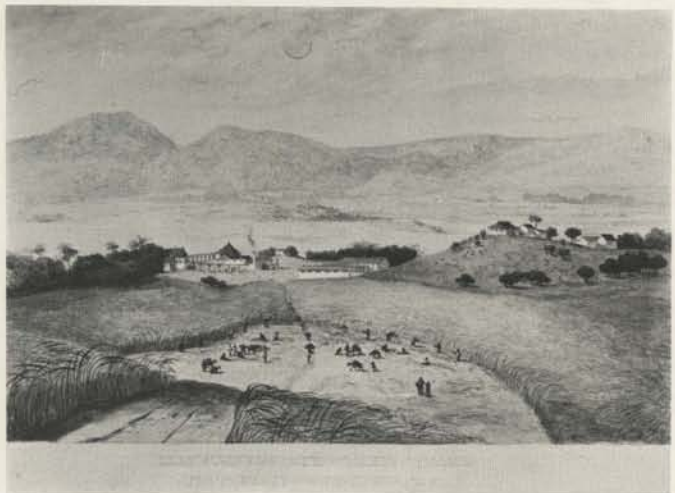
Llanrummy Estate, St. Mary's