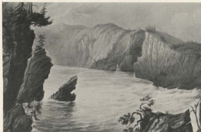
38. The Splits Rock, St. John's River, New Brunswick