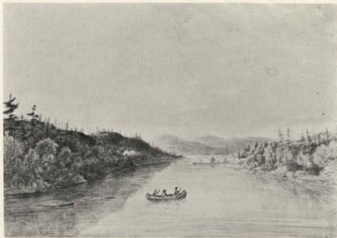
40. Shebananing or Killarny North Shore, Lake Huron, C.W.