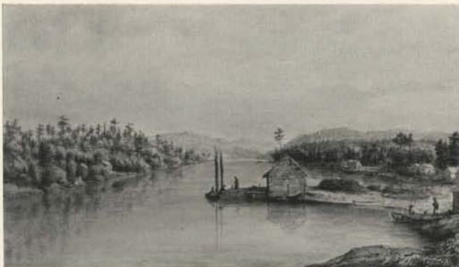
37. Killarny, or Lake Shebananing, North Shore, Lake Huron