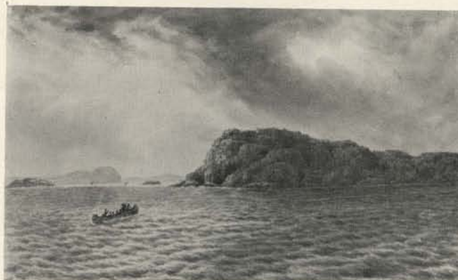
32. Cape Thunder Entrance to Thunder Bay, Lake Superior