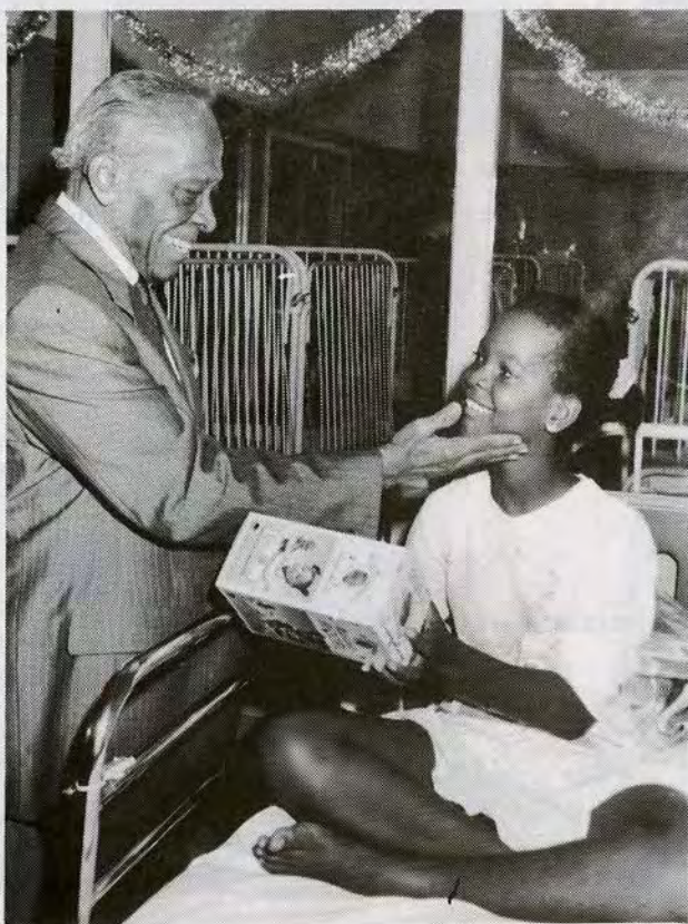
Bringing Christmas cheer to a delighted child during his annual Christmas tour of shut-ins.

Sir Florizel's first job was in the Civil Service with the Registrar of Titles Office. Although he was interested in pursuing Law as a profession, he eventually decided