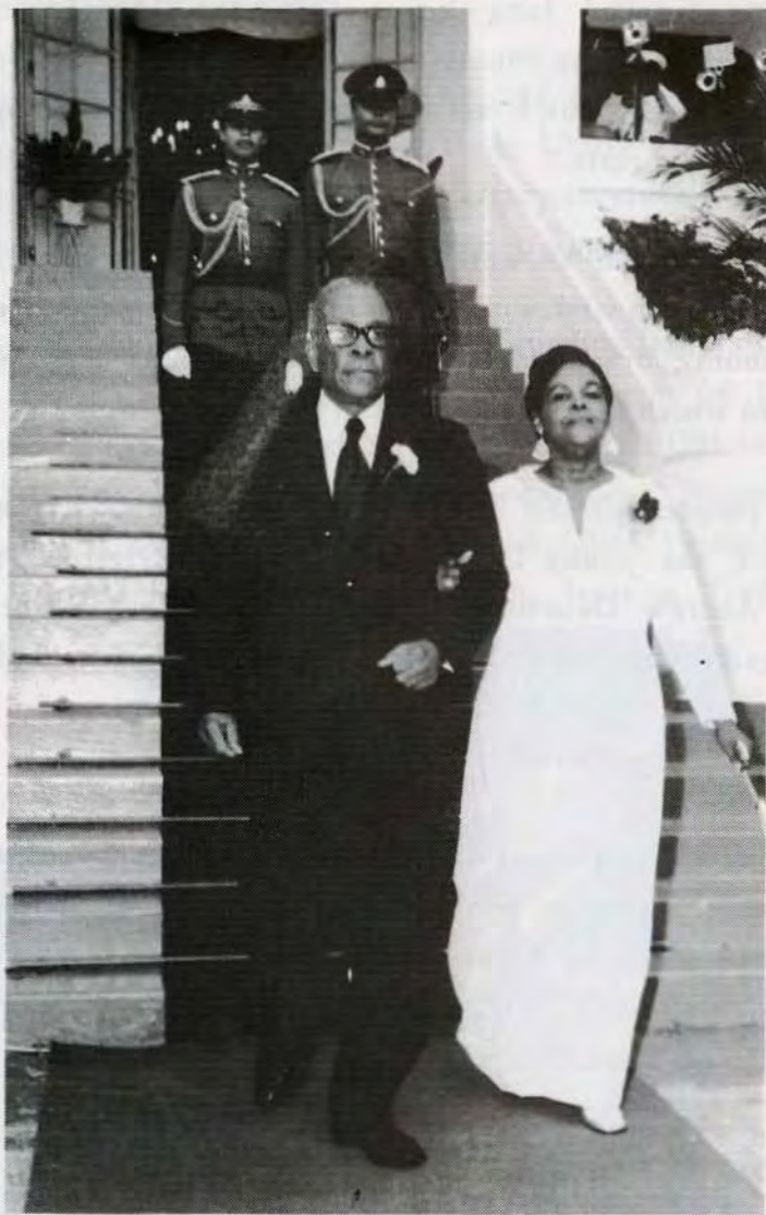
Sir Florizel and Lady Glasspole descend the stairs of King's House enroute to an official function.