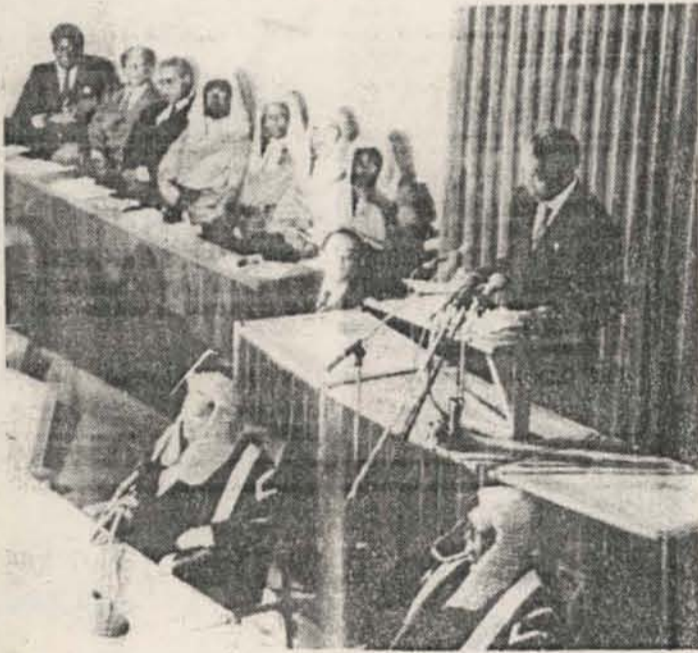
PRESIDENT OF THE SENATE At the Mandela sitting (right)