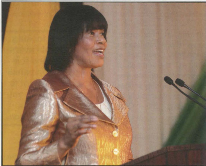
Prime Minister the Most Hon. Portia Simpson Miller addressing the 5 th Biennial Jamaica Diaspora Conference.

As Jamaicans, as one people with one aim, one hope, one destiny, we will succeed.