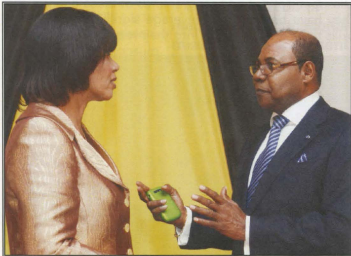
Prime Minister Simpson Miller in discussion with former Tourism Minister and Member of Parliament for East Central St. James, Edmund Bartlett.

This Diaspora Database will, among other things, allow us to present to the world, a smarter, stronger and more diverse workforce to attract investments to Jamaica, to access and distribute our exports into global markets, and to deepen the linkages and benefits to the domestic economy.