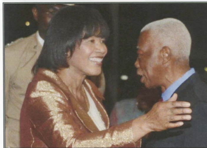
Prime Minister the Most Hon. Portia Simpson Miller greets Minister of Foreign Affairs and Foreign Trade, Senator the Hon. A.J. Nicholson, as she arrived for the opening ceremony of the Jamaica Diaspora Conference.

We know, by virtue of the immense success of the Diaspora policies and programmes of these nations, that they have been able to leverage significant wealth and skills technology transfer into their respective territories.