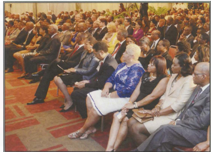
Participants at the 5 th Biennial Jamaica Diaspora Conference listen to Prime Minister Simpson Miller.

The Jamaican Diaspora is central to our nation's Growth and Development Strategy.