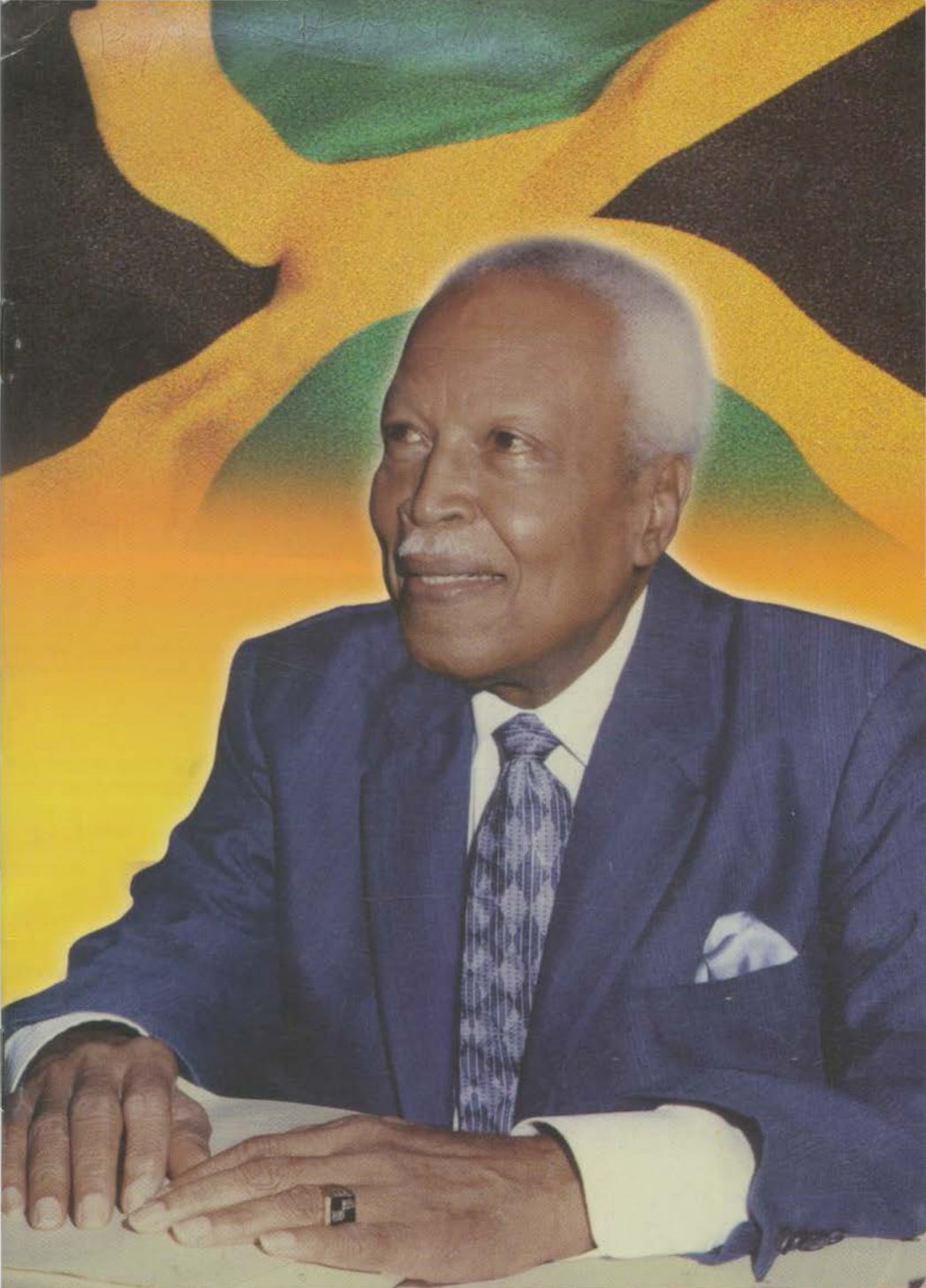
The Most Honourable Hugh Lawson Shearer, ON, OJ May 18, 1923 – July 5, 2004