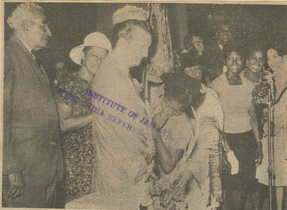
KING FOR A DAY: Mr. EDWARD SEAGA, then Min-

ister of Development and Welfare (third from left)