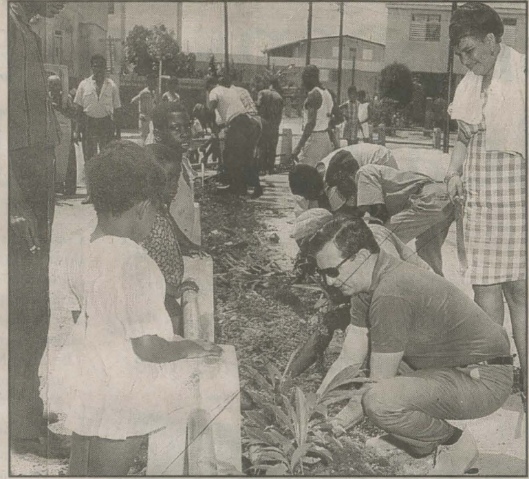
Minister of Finance and Planning Edward Seaga (stooping in foreground) leads a group of residents of Tivoli Gardens in a 'plant out' in the community in 1969.

It is said that it rains here every Sunday afternoon. Not only rains, but lightning flashes, and thunder rolls and yaps at the limestone