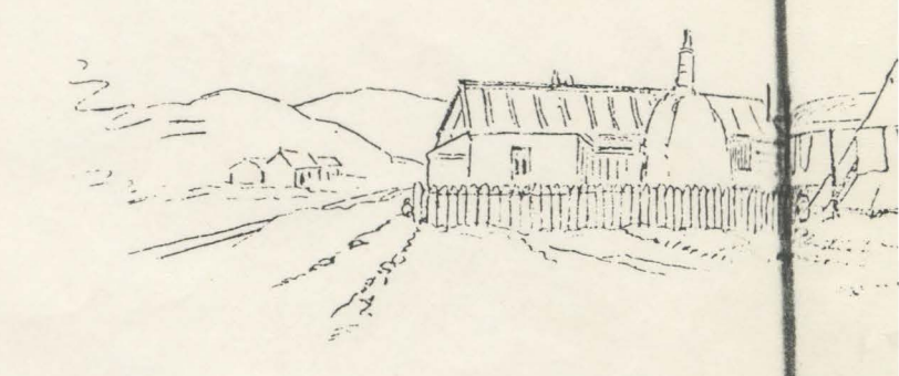
M" Seacole's hut