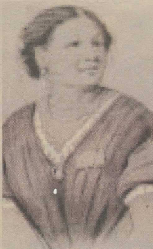
SEACOLE... named the greatest Black Briton

According to Vernon, the 100 Great Black Britons website received more than one million visitors with 10 per cent actually voting. The project sparked debate in the UK about the role of the black and ethnic minority community in British history and development. There was also a debate about the make up of