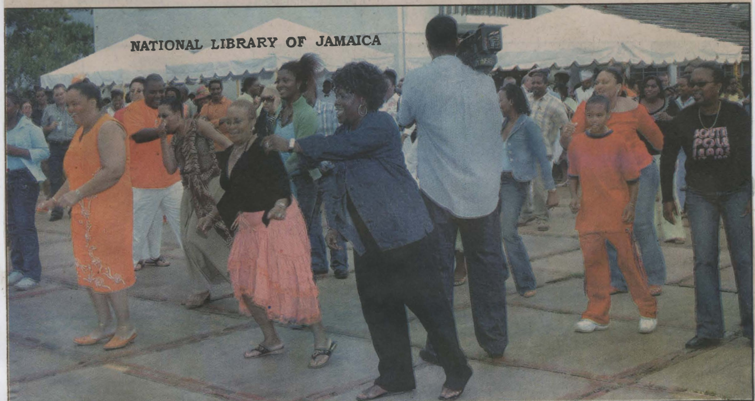
Guests get down to the music in the cool hills of Lydford, St. Ann. They were attending the Prime Minister's annual media party.