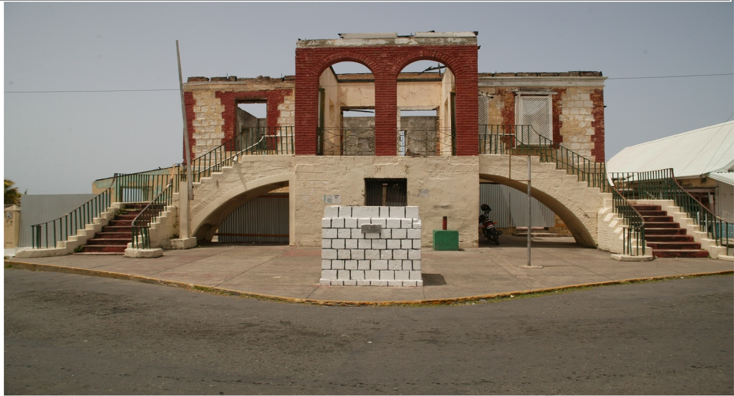
Remains of the Morant Bay Court House, 2015